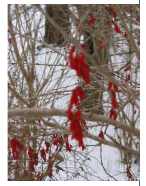
Jewels in the December snow. Southwestern Ontario, Canada.

sues and addressing questions raised by improved modeling abilities. As with all modeling, assumptions must be made. Violating assumptions can lead to errors that range from inaccurate harvest volumes to sub-optimal solutions. Managers must recognize and understand these critical issues, making decisions that will minimize bias and produce the most accurate insights. Look to a future issue of the FORSight Resource for the results of this study and what they mean for the resource planner.