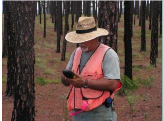
Inventory collection in longleaf pine plantation. Sand Hills State Forest, South Carolina.

FORSim LPGS is a versatile tool that provides biometricians and inventory foresters with the functionality of the longleaf pine growth engine in an easyto-use, excel-based interface. It provides a means for quickly analyzing and comparing stand-level treatments through graphical and tabular outputs. Users will find this to be a valuable addition to the FORSight Resources' FORSim product suite.